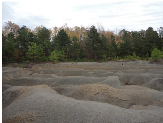
Selenite Site